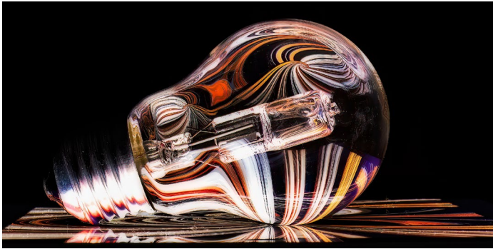
Winner - Paul O'Leary A Lightbulb Moment

With weather keeping me indoors, I looked for something interesting to photograph. The image is one of several hundred taken over a week or so, experimenting with light and glass objects. This image most appealed to me with the effect of light seeming to be more symmetrical between the bulb and lightsource.